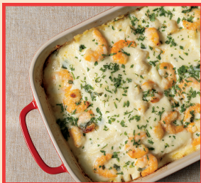
RED OR WHITE SEAFOOD LASAGNA