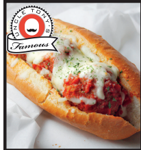
TUNA MEATBALL SUB