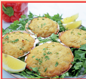
DOUBLE- STUFFED SCALLOPS