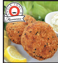
SPICY TUNA CAKES