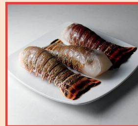
1 LB+ WARM WATER LOBSTER TAILS