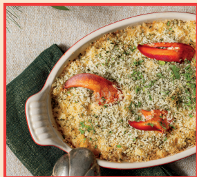
HOMEMADE LOBSTER MAC & CHEESE