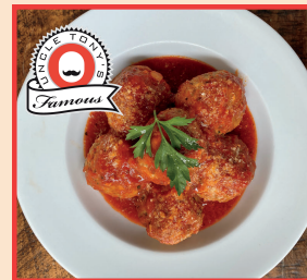
UNCLE TONY'S TUNA MEATBALLS