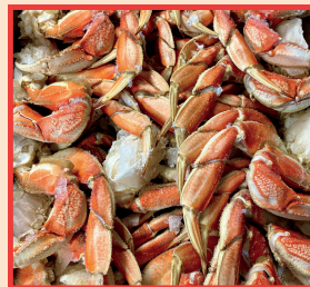
DUNGENESS CRAB CLUSTERS