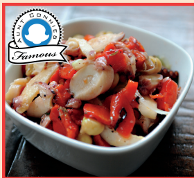
AUNT CONNIE'S OCTOPUS SALAD