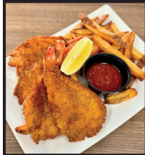
JUMBO FRIED SHRIMP & FRIES COMBO