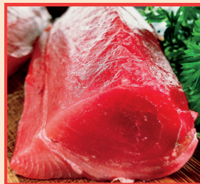
#1 TUNA SKIN-OFF LOINS