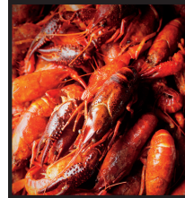
WHOLE COOKED CRAWFISH

3400 South Lawrence St (215) 389-8906 GiuseppesMarket.com