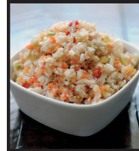
HOMEMADE PEPPER HASH