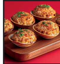
GIANT STUFFED CLAMS