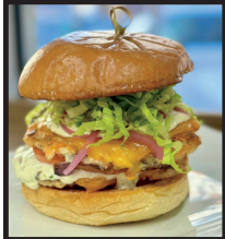
DOUBLE SMASH SALMON BURGER