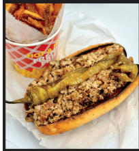
AHI TUNA CHEESESTEAK SANDWICH