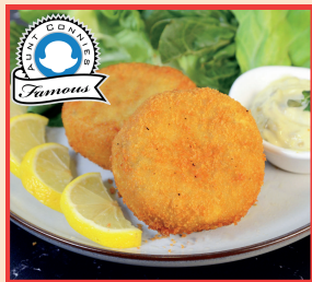
AUNT CONNIE'S FISH CAKES