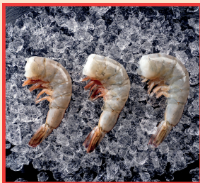
ALL-NATURAL LARGE 21/25 COUNT SHRIMP