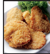
JUMBO FRIED OYSTERS