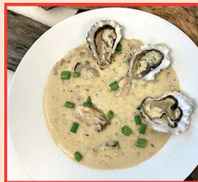
CALIFORNIA OYSTER STEW