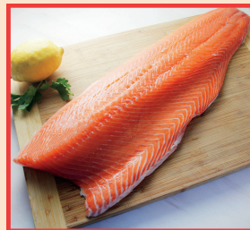
FRESH SKINLESS & BONELESS SALMON FILLETS