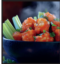
BUFFALO SHRIMP DINNER