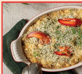
HOMEMADE LOBSTER MAC & CHEESE