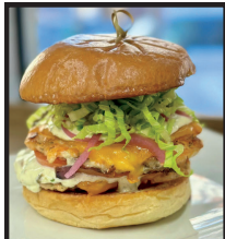
DOUBLE SMASH SALMON BURGER