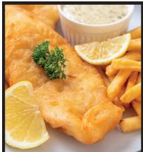
FISH & CHIPS COMBO