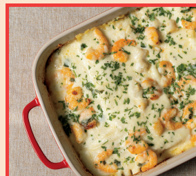
RED OR WHITE SEAFOOD LASAGNA