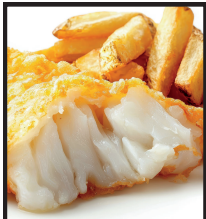
LOCAL FRIED FLOUNDER & FRIES COMBO

1300 Dickinson St (215) 389-8906 IppolitosSeafood.com