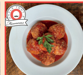
UNCLE TONY'S TUNA MEATBALLS