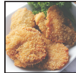
JUMBO FRIED OYSTERS