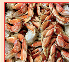
DUNGENESS CRAB CLUSTERS