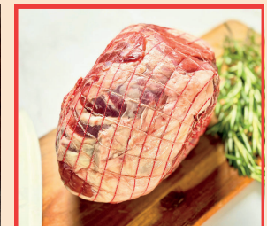
BONELESS LEG OF LAMB