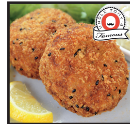
SPICY TUNA CAKES