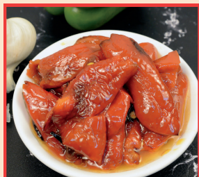
ROASTED RED PEPPERS