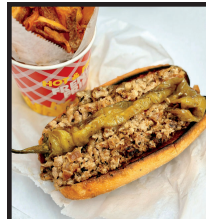
AHI TUNA CHEESESTEAK SANDWICH