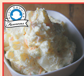
AUNT CONNIE'S HOMEMADE POTATO SALAD