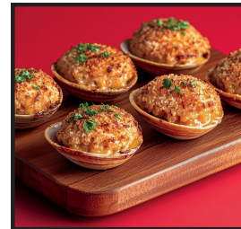
GIANT STUFFED CLAMS