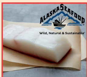
SKIN-ON HALIBUT FILLETS