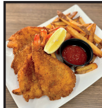
JUMBO FRIED SHRIMP & FRIES COMBO