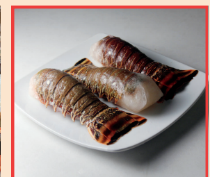
1 LB+ WARM WATER LOBSTER TAILS