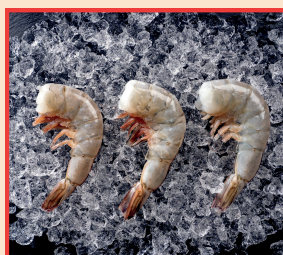
ALL-NATURAL JUMBO 16/20 COUNT SHRIMP