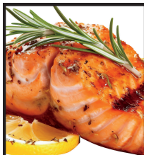
PAN-SEARED SALMON COMBO W/ 2 SIDES