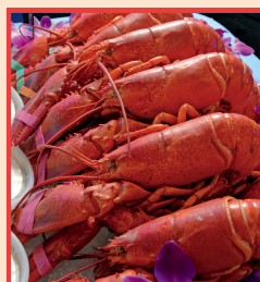
FRESH 1 LB STEAMED LOBSTERS