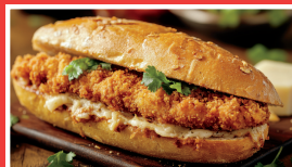
CHICKEN CUTLET W/ ROASTED PEPPERS & PROVOLONE