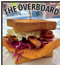
CRISPY FLUKE SANDWICH W/ SLAW, FRIES, & PICKLED CABBAGE