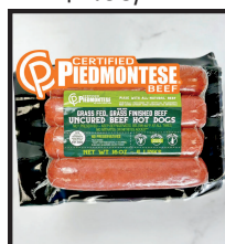
CERTIFIED PIEDMONTSE BEEF HOT DOGS