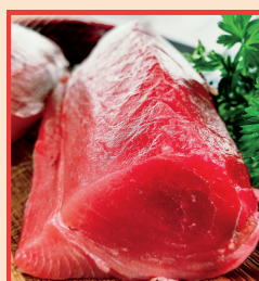
#1 TUNA SKIN-OFF LOINS