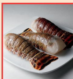
1 LB+ WARM WATER LOBSTER TAIL