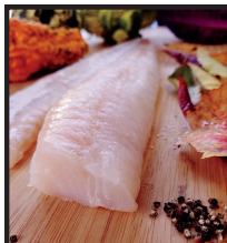
ALASKA SCROD FILLETS