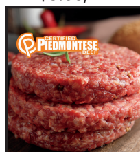
CERTIFIED PIEDMONTSE BEEF 8 OZ HAMBURGERS