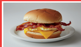
BACON, EGG, & CHEESE BREAKFAST SANDWICH