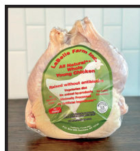
FRESH WHOLE CHICKEN