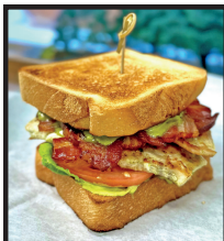
SWORDFISH BACON, LETTUCE, & TOMATO