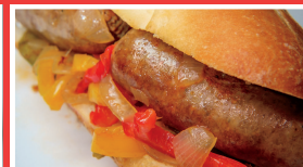
SAUSAGE & PEPPER SANDWICH