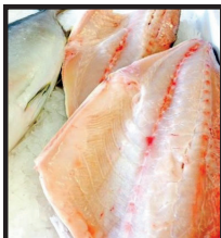
FRESH WILD YELLOWTAIL FILLETS