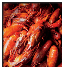
COOKED & SEASONED CRAWFISH