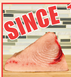
HOUSE-CUT SWORDFISH LOINS