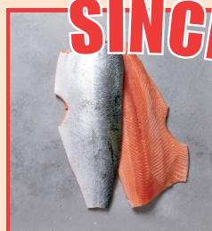
FRESH AKAROA KING SALMON FILLETS