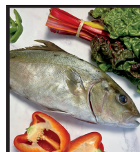
WILD WHOLE KANPACHI