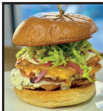
DOUBLE SMASH SALMON BURGER