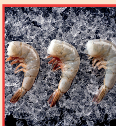
ALL-NATURAL JUMBO 16/20 COUNT SHRIMP