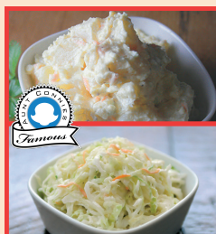
POTATO SALAD OR COLESLAW