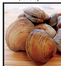
FRESH LITTLE NECK CLAMS