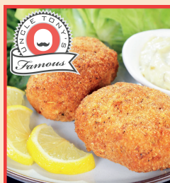
CLAW CRAB CAKES