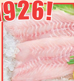
FRESH SKIN-OFF GROUPE FILLETS