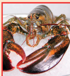
ALL SIZES LIVE LOBSTERS