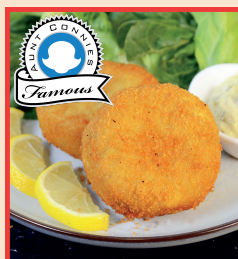
THE CITY'S BEST FISH CAKES