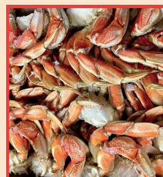
SNOW OR DUNGENESS CRAB