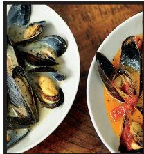
PAN-ROASTED MUSSELS W/ WHITE WINE OR MARINARA