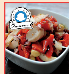
OCTOPUS (PULPO) SALAD