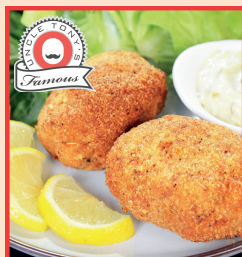
CLAW CRAB CAKES