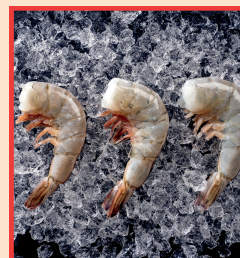
ALL-NATURAL JUMBO 16/20 COUNT SHRIMP