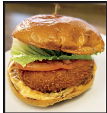
THE CRAB CAKE SAMMY