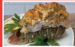
LOBSTER TAIL STUFFED WITH CRABMEAT $25.00/2

3400 South Lawrence St (215) 389-8906 GiuseppesMarket.com