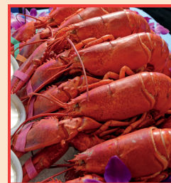
FRESH 1 LB STEAMED LOBSTERS