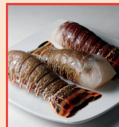
1 LB+ WARM WATER LOBSTER TAIL