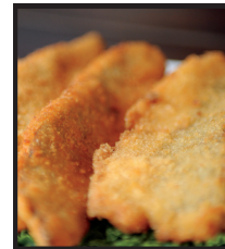
SEAFOOD CUTLETS $2.75/EA