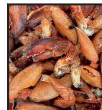
COOKED & CRACKED LOBSTER CLAWS 6/9 COUNT