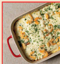
RED OR WHITE SEAFOOD LASAGNA