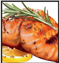
PAN-SEARED OR BAKED SALMON COMBO W/ 2 SIDES