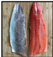
FRESH SKIN-ON STEELHEAD TROUT FILLETS