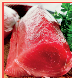
#1 TUNA SKIN-OFF LOINS