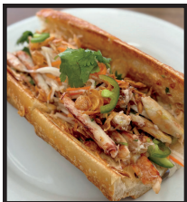
CRAB BANH MI