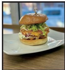
DOUBLE SMASH SALMON BURGER