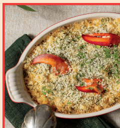
LOBSTER MAC & CHEESE