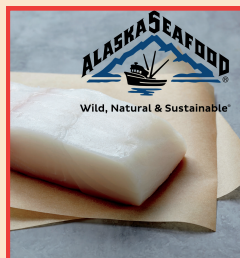
SKIN-ON HALIBUT FILLETS