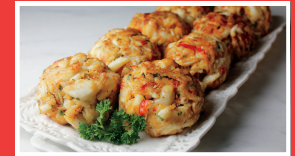
JUMBO LUMP CRAB CAKES - BROILED OR FRIED $15.00/EA OR 6 FOR $90