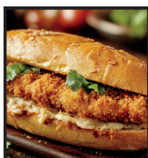
CHICKEN CUTLET W/ ROASTED PEPPERS & PROVOLONE