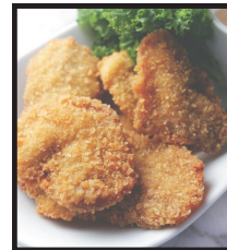
JUMBO FRIED OYSTERS $2.75/EA