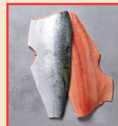
FRESH AKAROA KING SALMON FILLETS