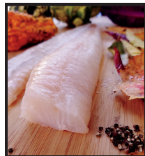
ALASKA SCROD FILLETS