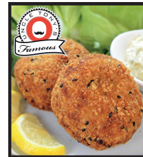
SPICY TUNA CAKES $2.75/EA