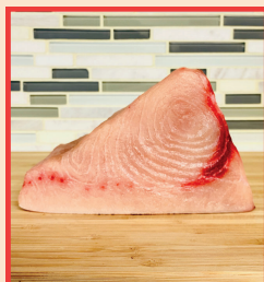
HOUSE-CUT SWORDFISH LOINS