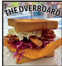
CRISPY FLUKE SANDWICH W/ SLAW, FRIES, & PICKLED CABBAGE