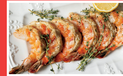
JUMBO SHRIMP STUFFED WITH CRABMEAT $25.00/3