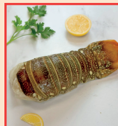
PETITE LOBSTER TAILS